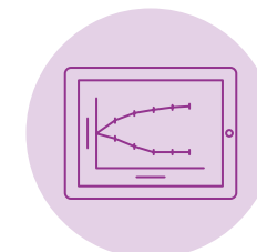
Innovative scientific and regulatory strategies