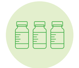
State-of-the-art, in-house expertise in vector manufacturing