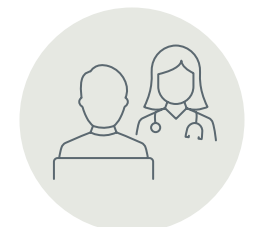
Strong commitment to improve patient care